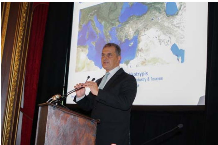
H.E. Yiorgos Lakkotrypīs Minister of Energy, Commerce, Industry & Tourism, Republic of Cyprus

Keynote Remarks: H.E. Yiorgos Lakkotrypīs , Minister of Energy, Commerce, Industry & Tourism, Republic of Cyprus