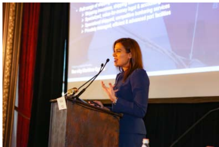
H.E. Natasa Pilides Deputy Minister of Shipping, Republic of Cyprus

Keynote Remarks: H.E. Natasa Pilides , Deputy Minister of Shipping, Republic of Cyprus