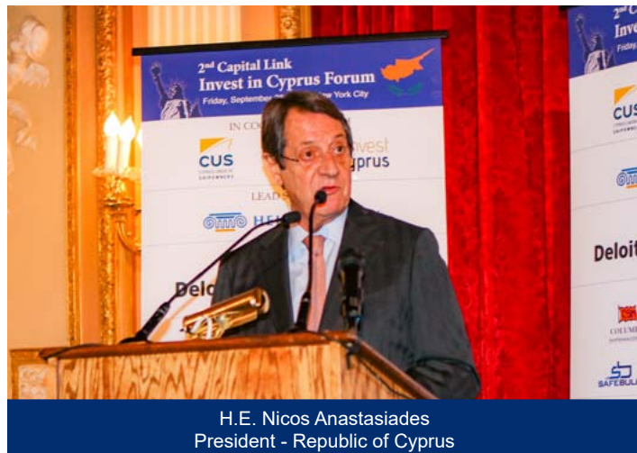
H.E. Nicos Anastasiades President - Republic of Cyprus