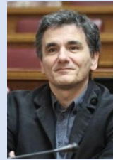
Hon. Euclid Tsakalotos