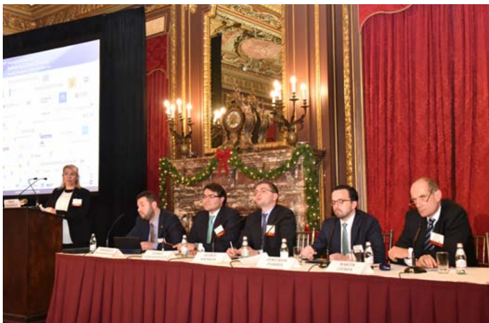
“NPLs – THE BIG OPPORTUNITY FOR RESTRUCTURING, GROWTH & INVESTMENT”