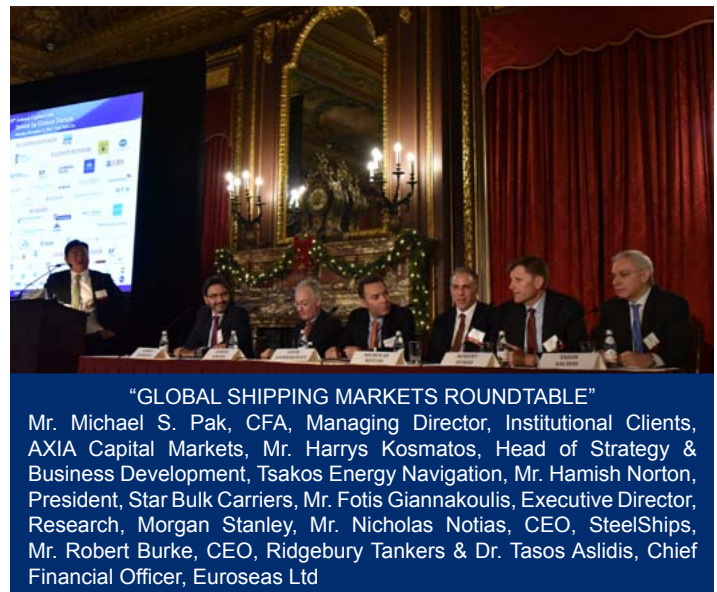
"GLOBAL SHIPPING MARKETS ROUNDTABLE"