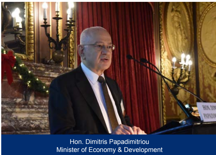
Hon. Dimitris Papadimitriou Minister of Economy & Development