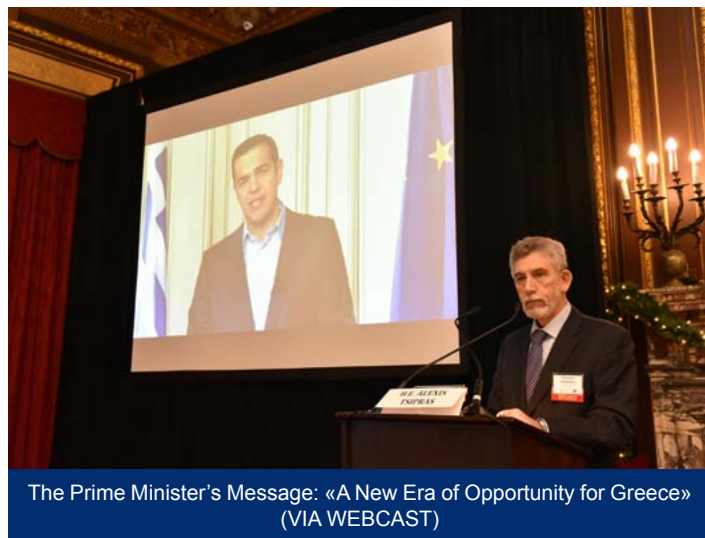
The Prime Minister's Message: «A New Era of Opportunity for Greece» (VIA WEBCAST)