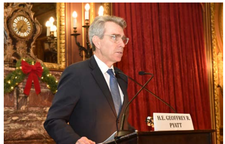
H.E. Geoffrey Pyatt Ambassador of the US to Greece