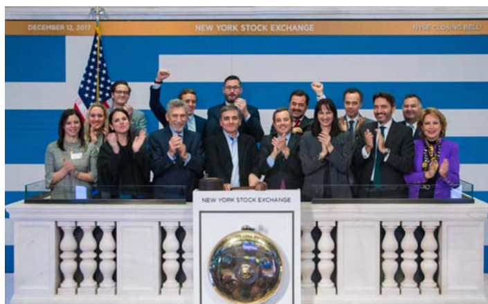
Hon. Euclid Tsakalotos, Minister of Finance of the Hellenic Republic, accompanied by Hon. Elena Kountoura, Minister of Tourism, Hellenic Republic and by the Greek Delegation, rang “The Closing Bell”

Hon. Euclid Tsakalotos, Minister of Finance of the Hellenic Republic, accompanied by Hon. Elena Kountoura, Minister of Tourism, Hellenic Republic and by the Greek Delegation, rang “The Closing Bell”, ending the trading session on Tuesday, December 12th 2017, in the presence of Greek companies listed on the New York Stock Exchange and companies that participated in the Forum. The event was broadcasted live on major news stations in the United States and abroad to an audience of millions of viewers worldwide.