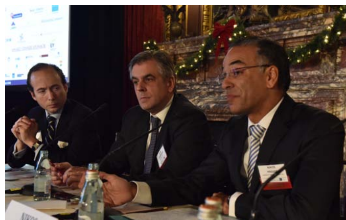
“TOURISM & HOSPITALITY”