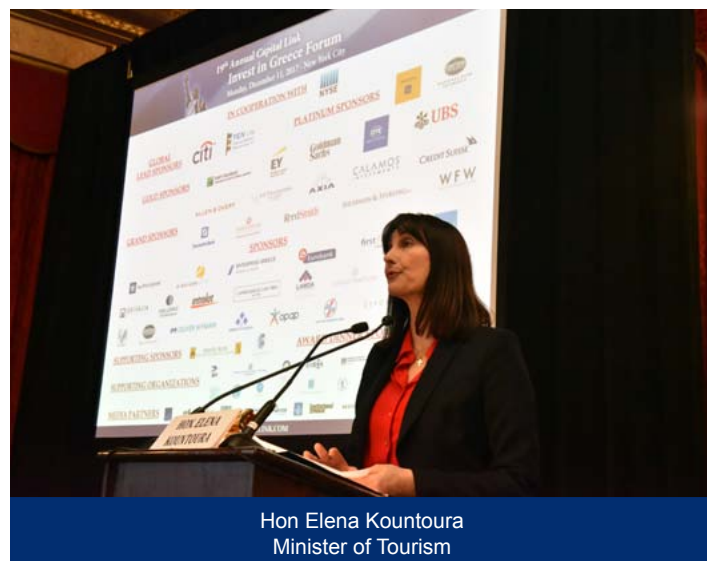
Hon Elena Kountoura Minister of Tourism