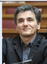
Hon. Euclid Tsakalotos Minister of Finance - Hellenic Republic