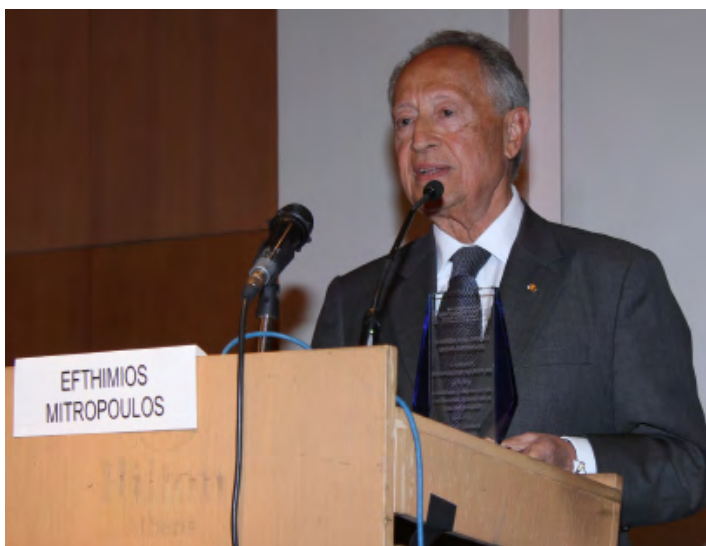
Mr. Efthimios E. Mitropoulos, IMO Secretary General Emeritus and Chairman of the "Maria Tsakos" Foundation