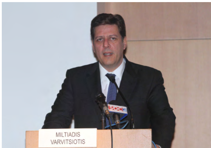
Mr. Miltiadis Varvitsiotis, Minister of Shipping, Maritime Affairs & the Aegean of the Hellenic Republic