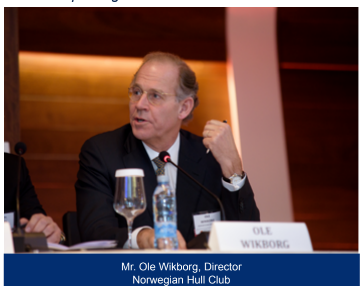
FORUM SESSION ON GEOPOLITICAL & REGULATORY DEVELOPENTS AFFECTING

partners, - they should even be prepared to pay an additional cost for a morecomplete total insurance package".