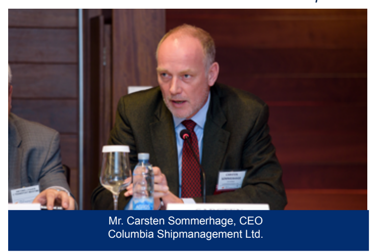
<u>Panel Discussion: Good People Pay Off - Crewing</u> Strategies and Staff Development

question of whether significant further optimization in shipping can be achieved, if systems on board of vessels become more standardized as it is for example in aviation. This will require however already a different approach for the construction of the vessels. In the long run this would have an effect on the available spare parts as well as the expertise to run these systems as crew training could be focused specific." much more and