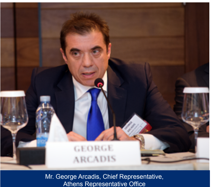
ABN AMRO BANK NV

Add fast decision-making, flawless execution, and integrated risk and portfolio management, and you can see why companies tend to stay with us for the long haul. For more on how our Transportation team could support your business, visit abnamro.com/etc."