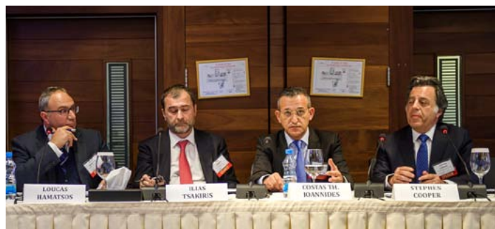
Marine Insurance & Reinsurance – Where is it heading?