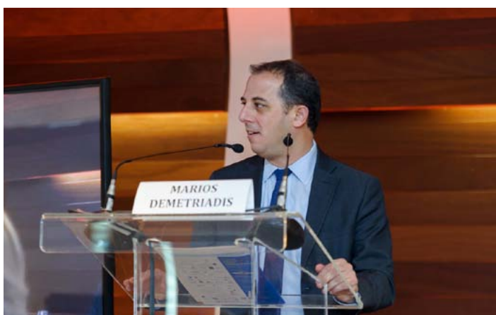
H.E. Marios Demetriades Minister of Communication Transport and Works Republic of Cyprus