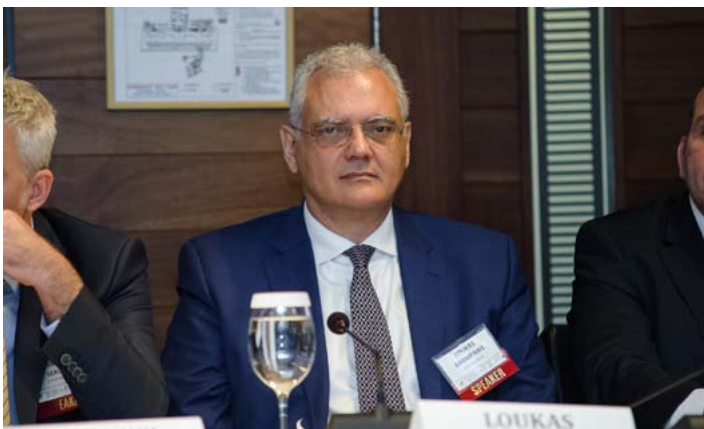
Dr. Loukas Barmparis President - Safe Bulkers

Looking ahead, we observe a positive market momentum and remain conservatively optimistic about the prospects of the charter market and its gradual improvement, supported by the scarcity of capital for those who do not nurture bank relationships. We anticipate the effects of the upcoming ballast water treatment and low Sulphur cap regulations. We are well positioned for 2018 with half of our fleet days contracted higher than our all-in break-even point, providing visibility of future cash flows and at the same time maintaining upside potential."