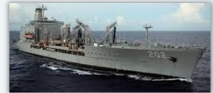
Dry cargo ships