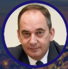
H.E. Ioannis Plakiotakis Minister of Maritime Affairs & Insular Policy Hellenic Republic